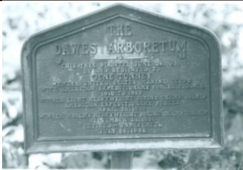
Gene Tunney, 1931 Heavyweight Boxing Champion Tree Dedicated: northern red oak