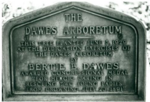
Bertie B. Dawes, 1929 Arboretum Co-founder Tree Dedicated: eastern white pine

The Arboretum has had 111 Tree Dedicators! Can you find these 6?