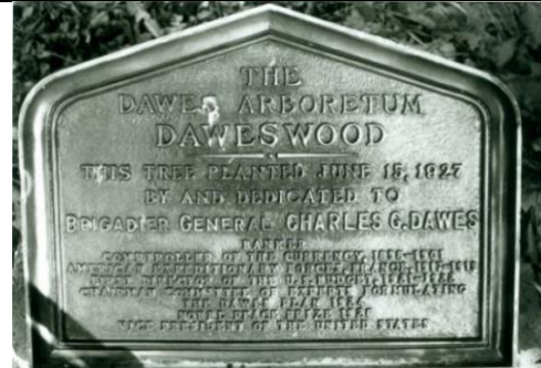
Charles G. Dawes, 1927 Brother of Co-founder & Vice President of the United States from 1925-1929 Tree Dedicated: swamp white oak